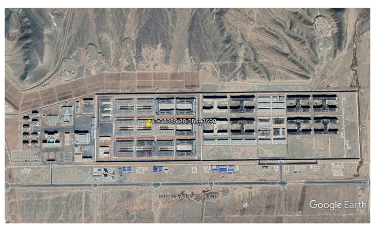
19 March 2020 (image available on Google Earth)