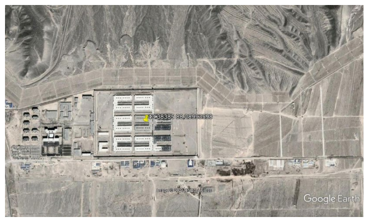
22 April 2018 (image available on Google Earth)